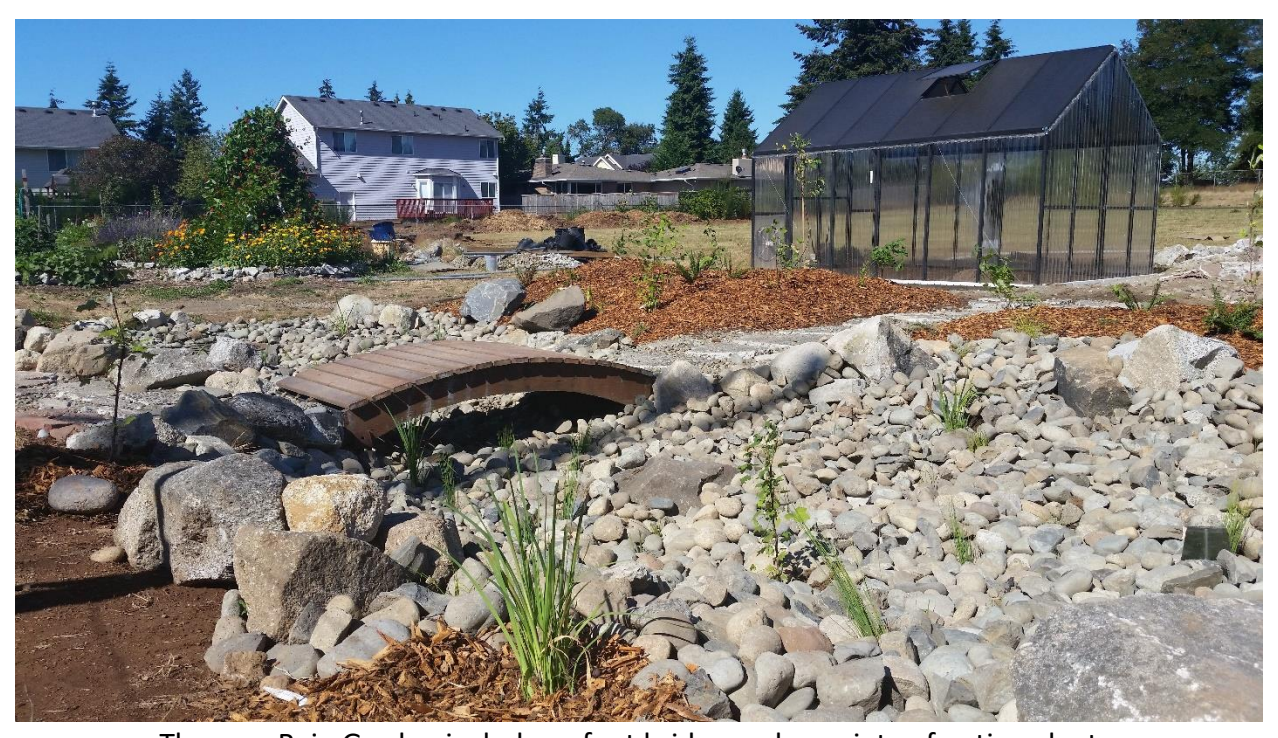
The new Rain Garden includes a foot bridge and a variety of native plants.

September 24<sup>th</sup> 2016 was a particularly special day, in the Shark Garden, when 457 volunteers from NAIOP came to volunteer on the New Start campus. About a third of them worked in the garden area, serving around 914 hours! The NAIOP brought with them an estimated $164,000 worth of materials and equipment donations to the campus and around $55,000 of that was spent in the Shark Garden. Other parts of the school campus received improvements that included landscaping, painting, new signage, new picnic tables, and various other repairs. We are very grateful for all of these improvements. Photos and videos can be seen on our Facebook page from that day.