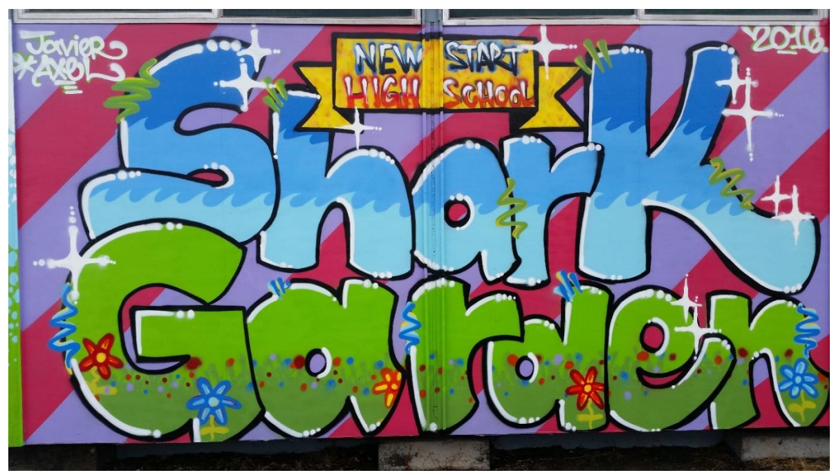
The new Shark Garden mural. This image will likely be the cover of our Thank You cards.

storage space. A gravel road was added to connect the western entrance to a new southern arbor gate entrance. Four large bed areas were prepared as public pea patches and currently the District is exploring potential partnership opportunities with the Burien Parks Department for this community area. Another landmark was reached when a new water meter was funded and installed, by the community, so that the garden will now have its own water supply. The $8,000 price tag for the water meter was split between the Highline School District and individual donors. The new 400 square foot demonstration rain garden was completed and planted with native plants. The greenhouse was moved from the high school courtyard over to a spot next to the rain garden. A Shark Garden mural was created by students on the school portable wall, facing the garden. The fence along the western side of the garden was also given a fresh coat of paint. All of these improvements have really started to give the garden an identity in the community.