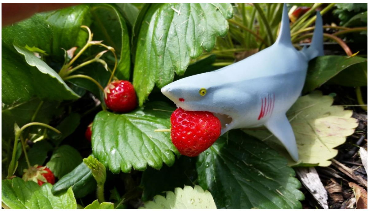
Example of one of our most popular Facebook posts, our mascot showing what was fresh that day.

Our Facebook page can be found here: https://www.facebook.com/theSharkGarden/